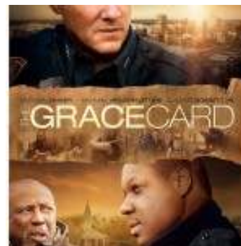
Featuring: The Grace Card